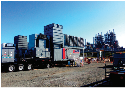
Confidential Customer, South Pacific

Our modular power plants are custom designed for rapid deployment anywhere in the world. Through our proprietary installation process, we can begin to deliver in 30 to 90 days – much faster than the 3-5 years required to finance, construct and commission a permanent plant.