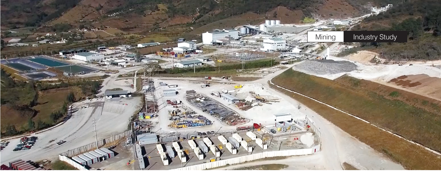
Minera San Rafael, S.A., Guatemala