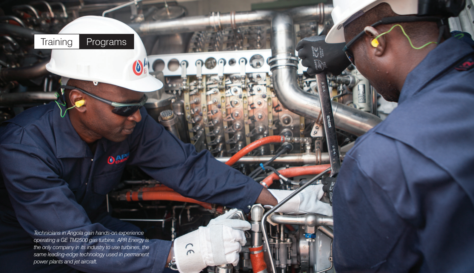
Technicians in Angola gain hands-on experience operating a GE TM2500 gas turbine. AP Energy is the only company in its industry to use turbines, the same leading-edge technology used in permanent power plants and jet aircraft.